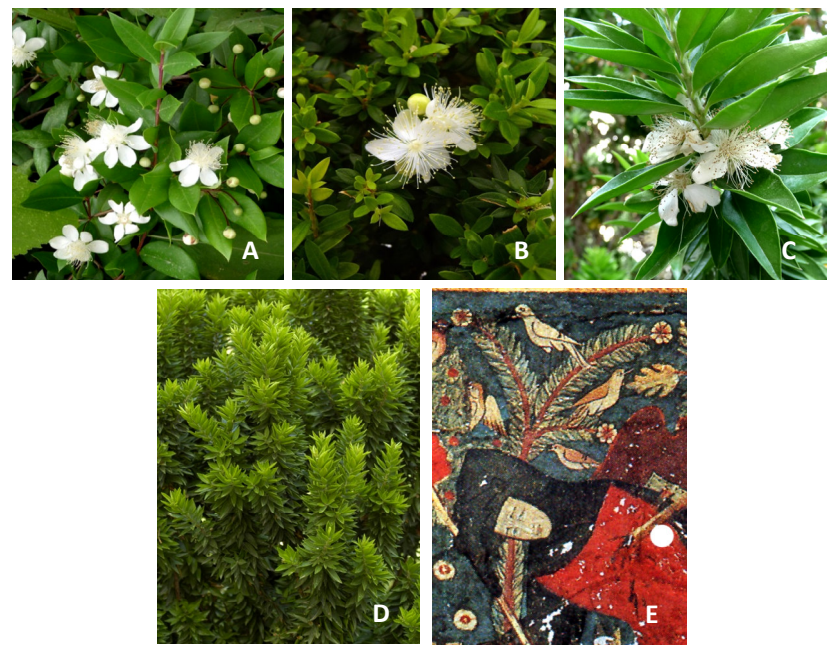
Figure 1. (A) Wild type Myrtus communis ; (B) Cultivated variety Myrtus communis subsp. tarentina ; (C) Cultivated variety Myrtus communis subsp. baetica (described by Pliny as hexasticham and named Moorish myrtle by Clusius); (D) Myrtus communis subsp. Baetica ; (E) Detail of painting of Hall of the Kings of the Alhambra, where the morphological characteristic of Moorish myrtle can be clearly identified.

This myrtle was widely used in the Alhambra until at least the 17<sup>th</sup> century (Mariutti, 1934) when it began to be gradually replaced by Myrtus communis subsp. tarentina for aesthetic and practical reasons (finer foliage, more compact growth), and the Moorish myrtle was