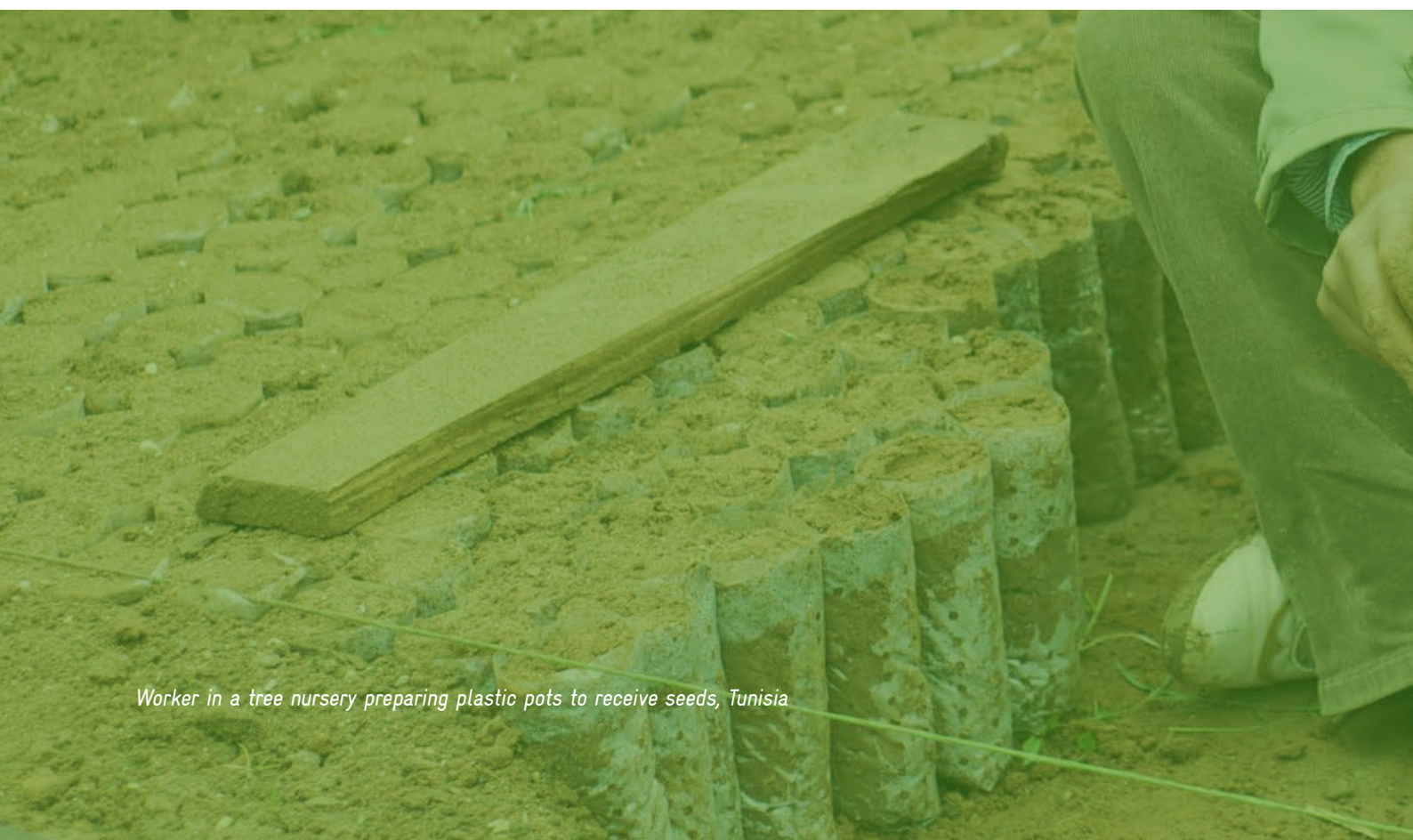
Worker in a tree nursery preparing plastic pots to receive seeds, Tunisia