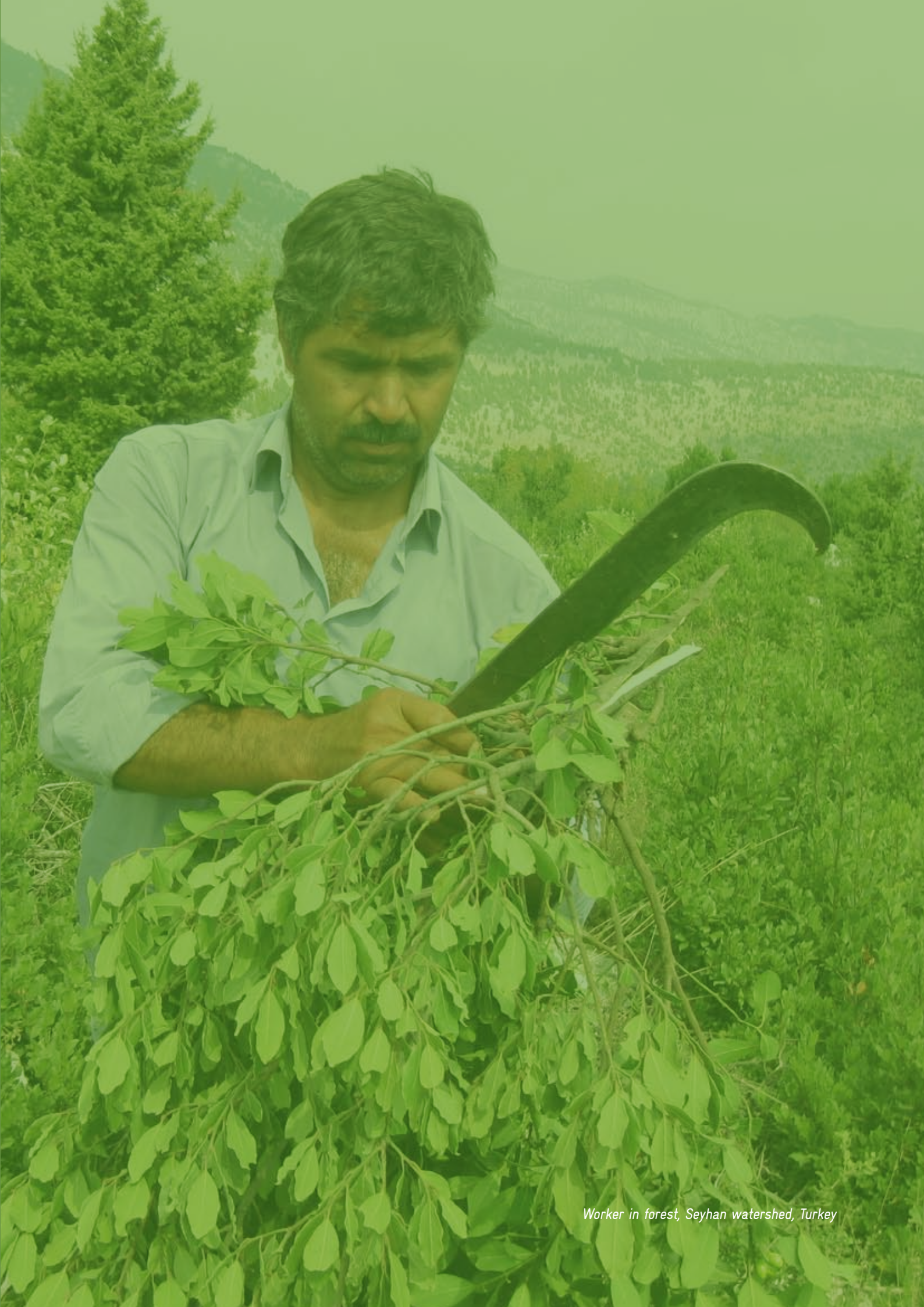
Worker in forest, Seyhan watershed, Turkey