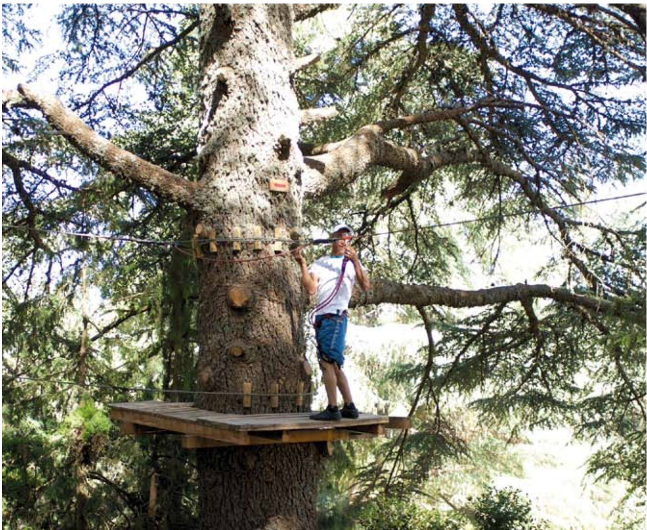
Touristic activity in cedar trees, Michlifen, Morocco

To improve forests' contribution to a green economy, it is necessary to make efforts to improve governance and inter-sectoral cooperation. As discussed in section 1, forests can play an important role in increasing economic, social, and ecological resilience in the context of climate change. Forests can reduce temperatures locally by several degrees, and by facilitating infiltration can help reduce the impact of more variable and intense rainfall. In Nicaragua, for example, the World Bank is financing a project that will use PES to encourage the expansion of forest land uses (albeit primarily agro forestry or silvo pastoral practices, rather than pure forest) to reduce the vulnerability of rural water supplies to the impact of climate change (World Bank 2012c). Other watershed projects aimed at incorporating natural forests and endemic riparian woodlands as part of micro catchment vegetation management with local communities, including the Lakhdar watershed in Morocco , the northern Yemen wadis, and Turkey's Eastern Anatolia Basin (World Bank 2009). In this regard, fundings for Adaptation to Climate Change (e.g. from the Adaptation Fund) may bring opportunities for the development of forestry projects.