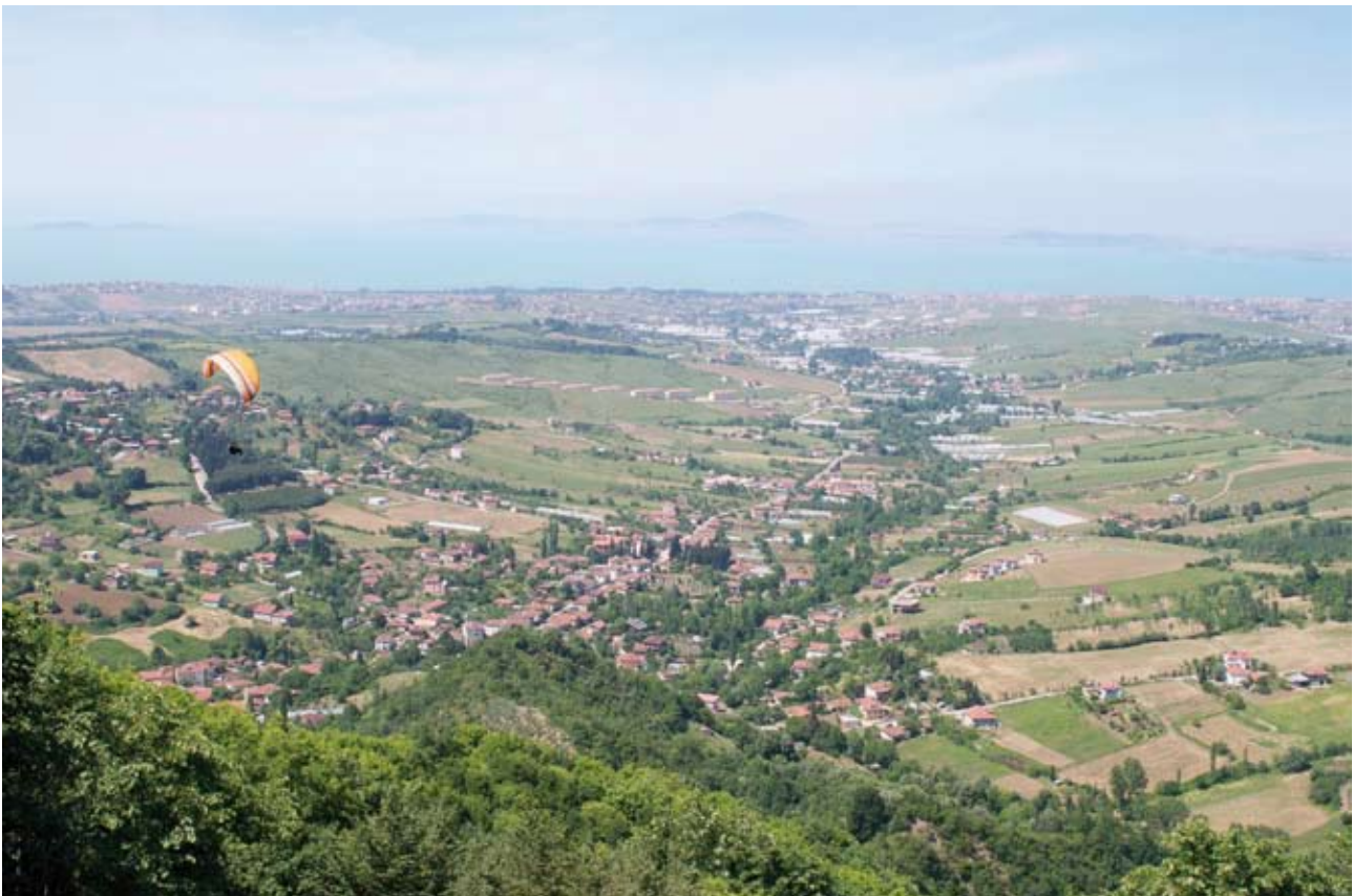
Ecotourism in Yalova, Turkey