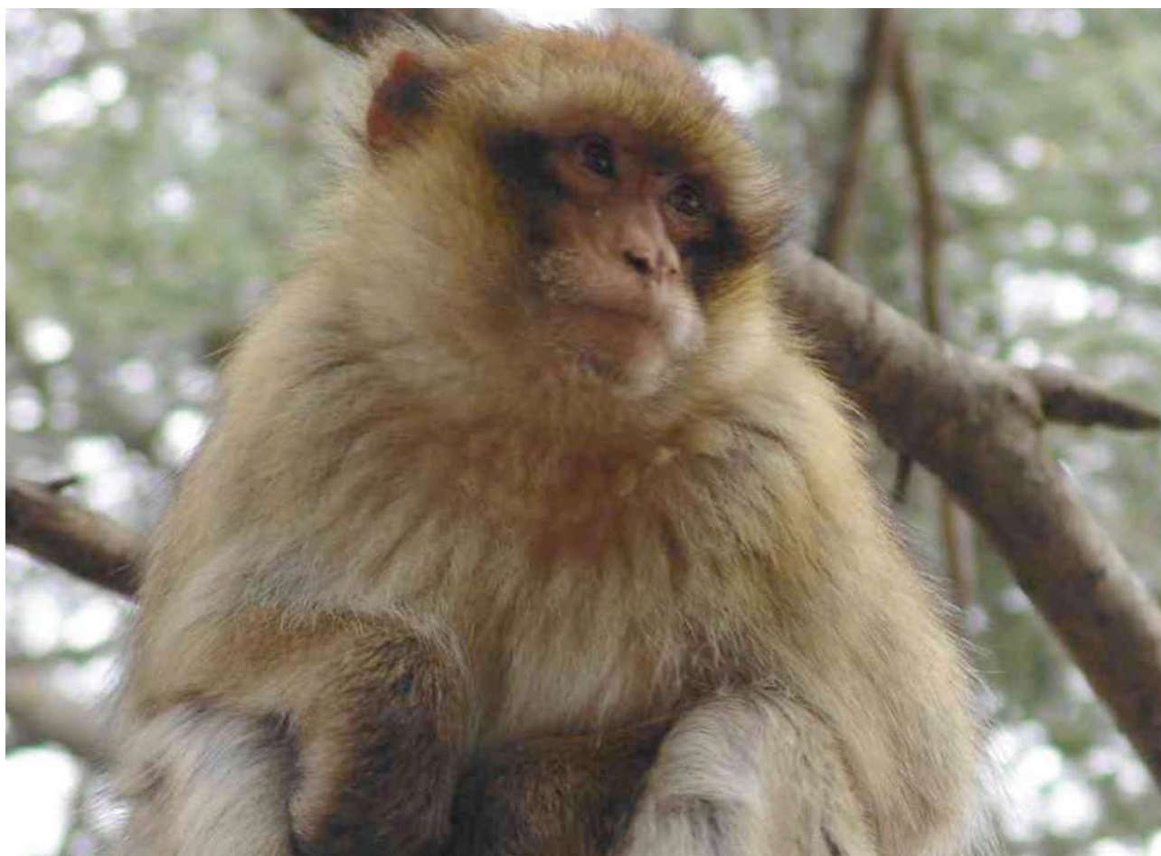
Magot monkey, Chrea National Park, Algeria

Though such approaches have already been developed in several MENA countries, they remain largely one-off exceptions from the conventional dependence on domestic government budgets and foreign donors, rather than systematic approaches. Perhaps the most promising are the entrance fees and the PES for water (IUCN 2006).