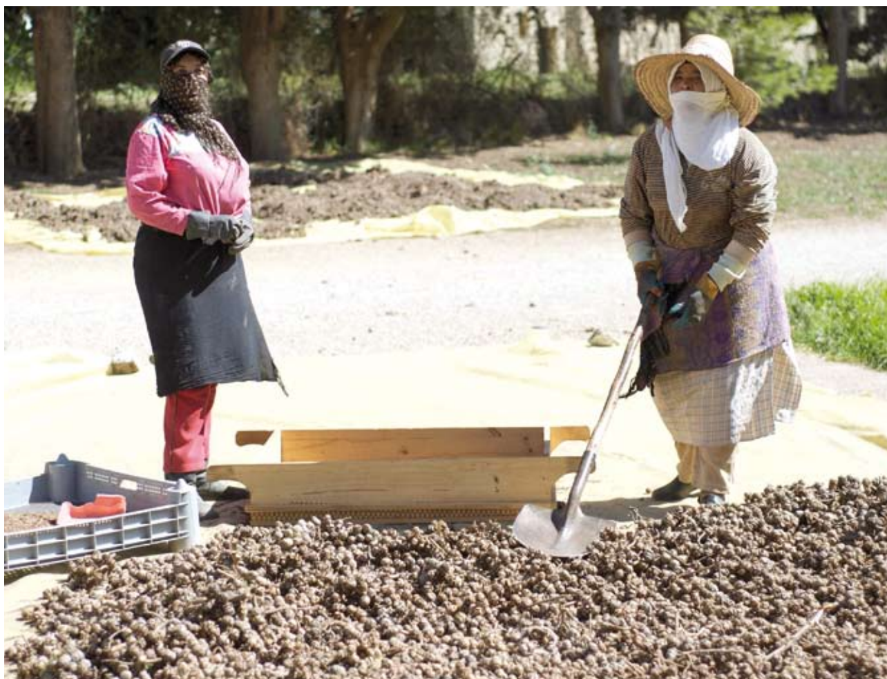
Women processing cones to get seeds, Morocco

Last but not least, this document is not a final step; it is just a snapshot of the existing situation aiming at highlighting the need for action and provoking additional work in key areas to support a green economy in the MENA region.