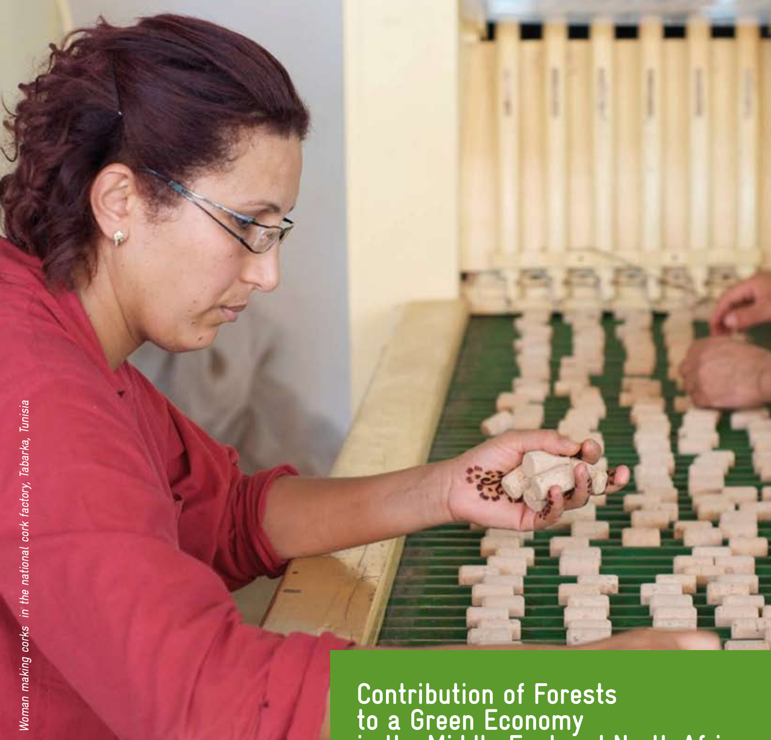
Woman making corks in the national cork factory, Tabarka, Tunisia