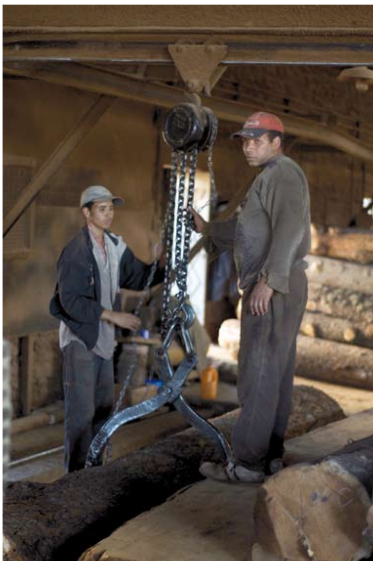
Workers in sawmill, Morocco

In Lebanon, a more indirect scheme of PES has been used. The Banque Libano-Française, in partnership with the United Nations Development Programme - Lebanon (UNDP) and MasterCard, launched in 2011 a unique card on the Lebanese market: the Earth Card. While using it to pay for purchases, a percentage of the profits generated through card payments is transferred for the funding of environmental projects in Lebanon under the supervision of the UNDP-Lebanon 23 . By the end of 2012, the Bank awarded about US$40,000 to finance three projects in the field of renewable energy and energy efficiency (Banque Libano-Française-UNDP 2012) 24 .