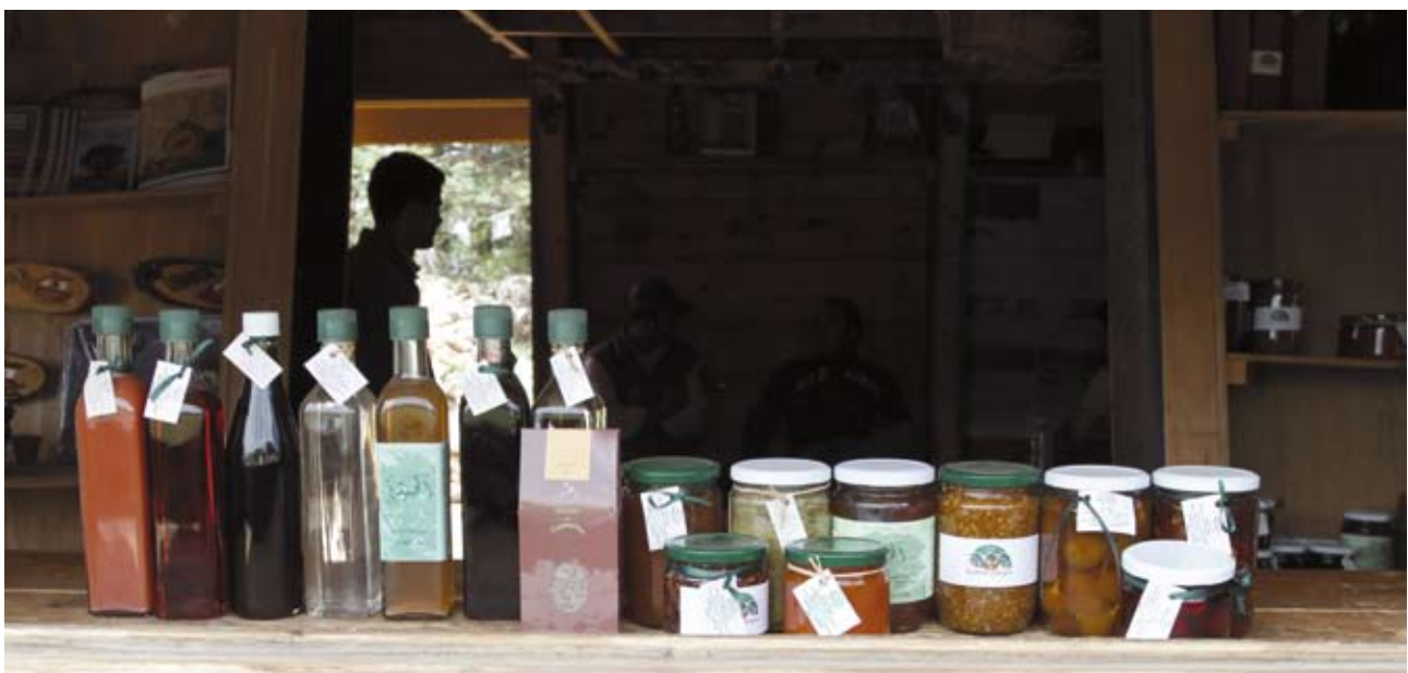
Non-Wood Forest Products, oils and jams, Tannourine Natural Reserve, Lebanon

Other forest benefits are particularly underestimated and need further analysis. Recreation is likely to be a significant forest benefit in CPMF countries. However, available estimates are limited to certain areas, such as forest parks and reserves. Hunting benefits have been estimated only for a few countries and vary considerably from US$1–99/ha, due to differences in site characteristics and valuation methods. As efforts to estimate non-use values of biodiversity are very scarce and site-specific, the estimated value of biodiversity remains almost negligible, at about 2 percent of the countries' forest TEV, or US$7/ha on average. Because these estimates are particularly weak, no strong conclusions can be drawn.